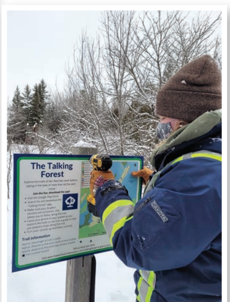
Continued from page 16

through the Habitat Compensation Program at Pigeon River Headwaters Conservation Area.